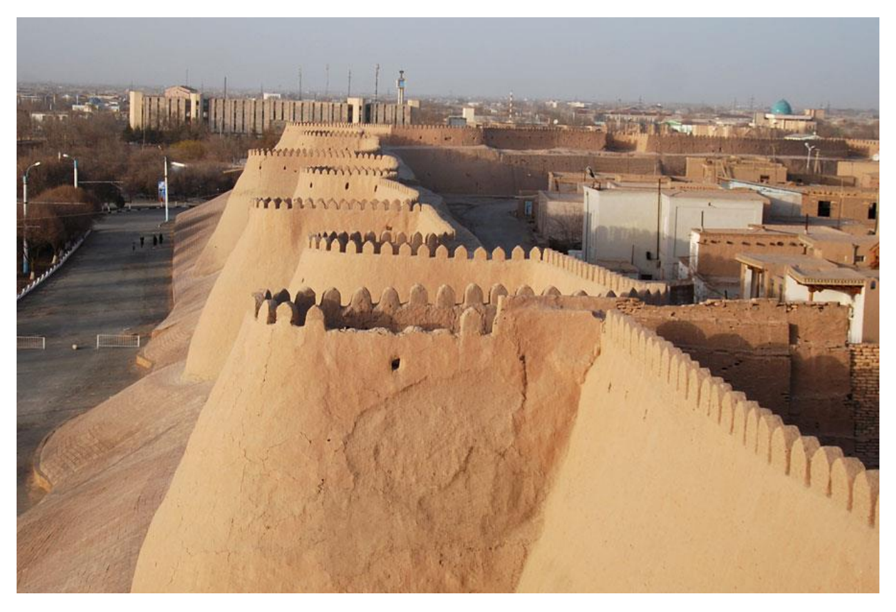
Itchan Kala in Khiva

Ichan-Kala is the Khiva point of attraction. This is an ancient fortress surrounded by a high defensive wall. Ichan-Kala occupies 26 hectares. Today, about 300 families live here, most of whom are hereditary artisans. The state Historical and Archaeological Museum-reserve is located on the territory of the fortress. All the significant attractions of Khiva are located in Ichan-Kale. The construction of the fortress began in 1598. Most of the buildings that have survived to the present day were built in the XVIII-XIX centuries, but there are also earlier ones. Scientists suggest that Ichan-Kala stands on an old fortification, which was located here in the V century.