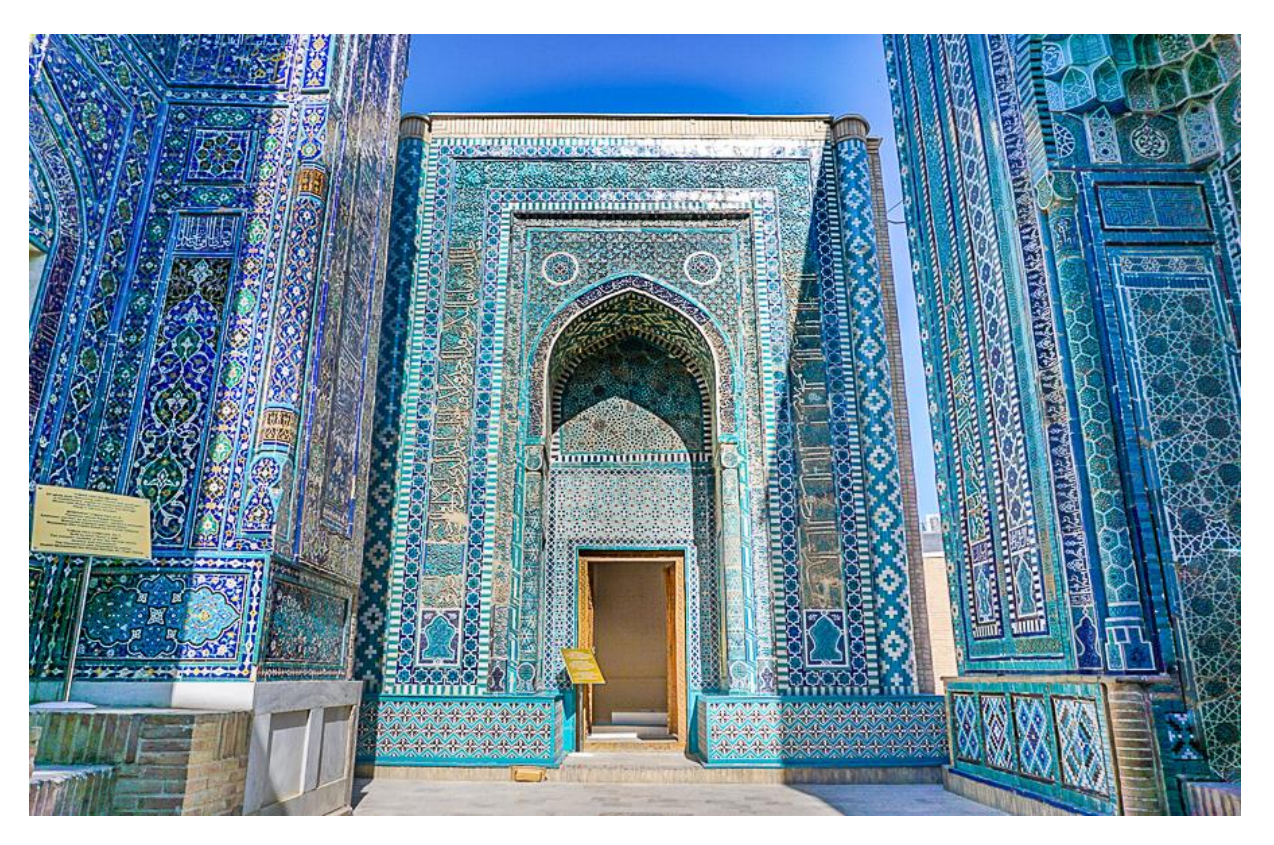
Gur Emir Mausoleum