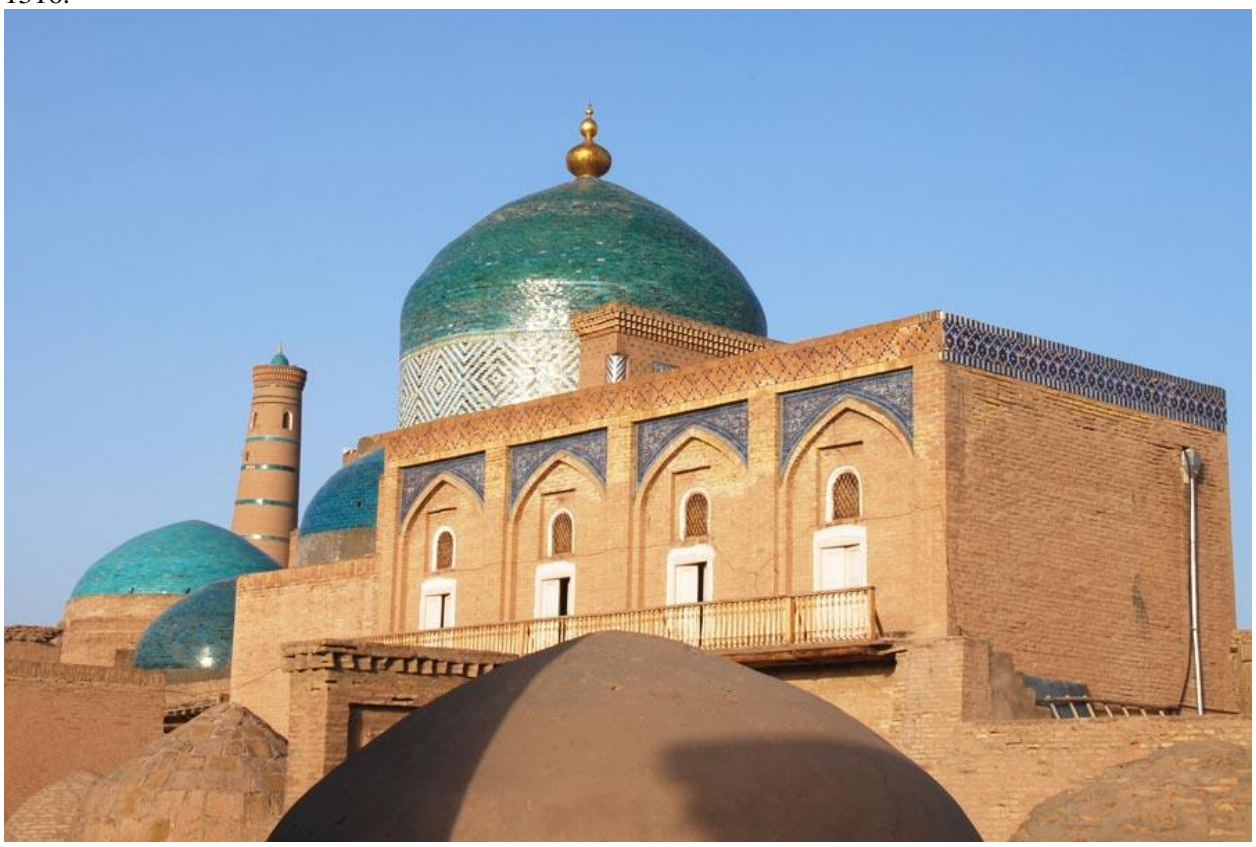
The mausoleum of Pakhlavan Makhmud

The first Juma mosque was built here in the 10th century. The modern Friday mosque was built at the end of the XVIII century. The building is unique in that it has neither portals nor domes. Inside the mosque there are 213 columns made of wood, which, as it were, support the ceiling. At the same time, 21 columns have been preserved since the X-XII centuries. And the oldest carved doors of this mosque were created in 1316.