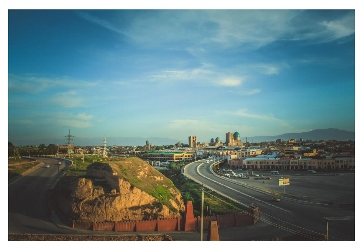
"Old city" Samarkand