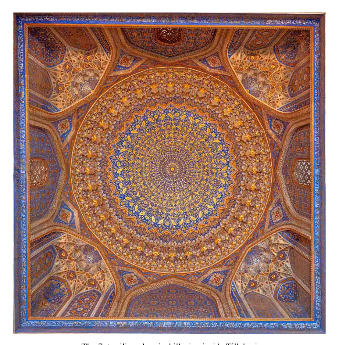
The flat ceilinged optical illusion inside Tillakori