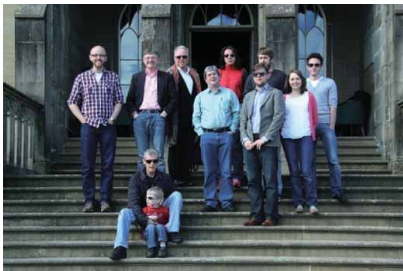
Some of the FAI staff and Research Associates

We also engage in “near market” research that attracts private sector funding. For example we have conducted many impact studies for sectors, firms and activities across Scotland over the years. Some recent work includes the economic impact of shipbuilding on the Clyde, the grouse shooting industry in Scotland, and the impact of Glasgow’s two football clubs – Celtic and Rangers. The latter study, in particular, exposed a whole new audience to the intricacies of inter-regional IO modelling!