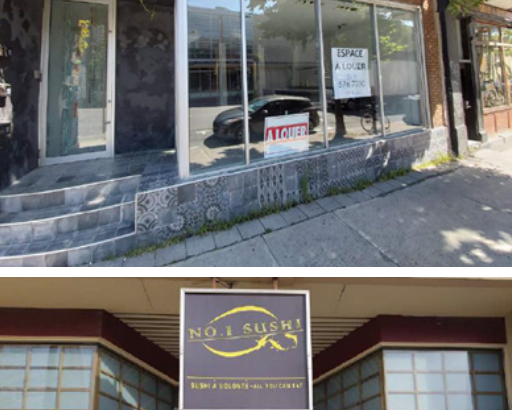
Figure 2: SDBSL. 2020. Mémoire présenté à la Commission sur le développement économique et urbain et l'habitation dans le cadre de la consultation publique au sujet des locaux vacants à Montréal. http://boulevardsaintlaurent.com/fr/download/?pid=9693

Figure 1: INRS (Othmane Sajid). Data: ARTM. 2013. Enquête Origine-Destination. Ville de Montréal, 2016